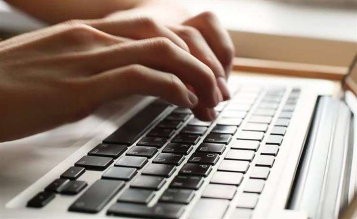
Letters stock image

With reference to your article Sit For Climate Protests At Station (Advertiser, December 7) I would like to point out an alternative view shared by a great — and increasing— number of eminent and highly qualified scientists working in the fields of climatology. I agree that climatic change has definitely occurred over the last 50 years, but the need to reduce carbon, ie carbon dioxide, emissions is quite definitely being disputed. The fact is that there never has been any empirical scientific evidence that rising C02 causes climatic change.